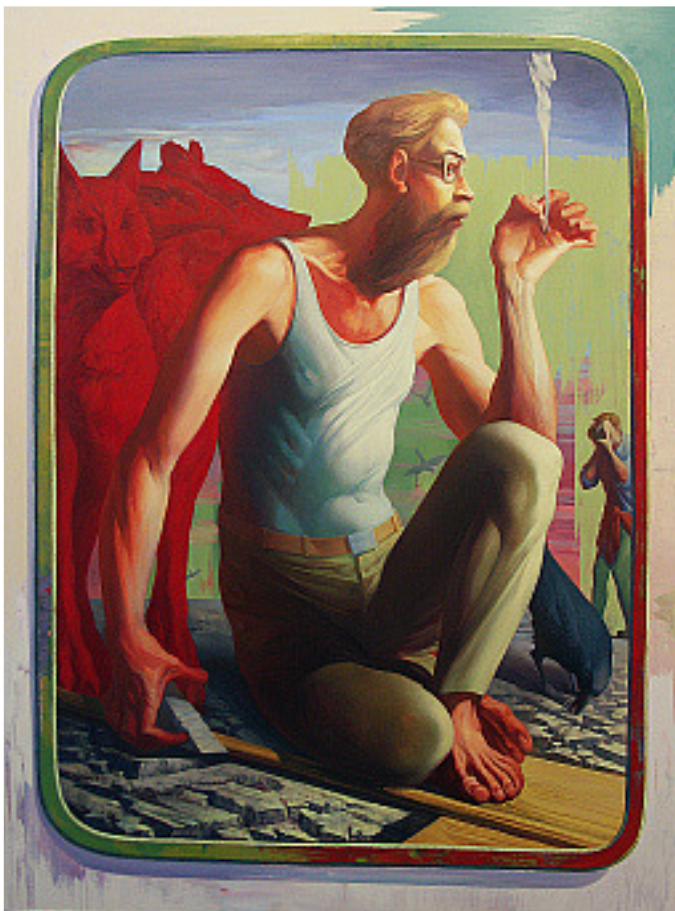
A Small Break , Öl auf Leinwand, oil on canvas, 200x150 cm, 2012

It may seem inappropriate for a snob that stylistic experiments merge with social pathos, but looking deeper in Russian art history we can see that even such radical artists as Malevich and Suetin found the way to combine their pictorial ideas with socially oriented subjects. Why so? Perhaps because the artist in Russia never felt himself quite satisfied with his position - just painting is not enough - it does not even has sense - it gets one while contacting the social substance and though remains in people's memory. Egor Kosehelev