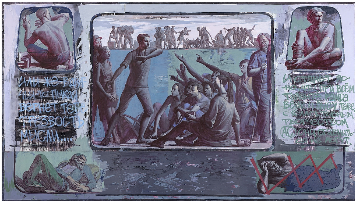
Detail aus "Kapella", 2, 70 x 14 m (insgesamt 17 Teile), Acryl auf Leinwand, 2011 Detail from the work "Kapella", 2, 70 x 14 m (total 17 parts), acrylic on canvas, 2011

geschlossen / closed : 24.12.2012 - 06.01.2013