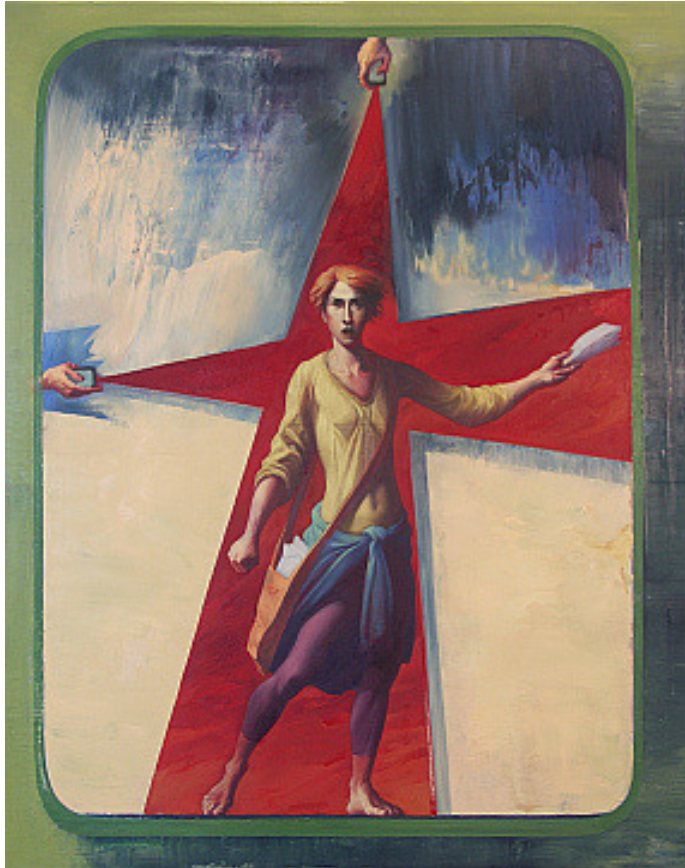
The Propagandist, Öl auf Leinwand, oil on canvas, 100x80 cm, 2012

During the last two years, being a witness of ever-growing social movement, both at my homeland Russia and all over the world, I have been working on several works based on my impressions of this important process. It should be marked that artistic strategy revealing the social realities has long history in Russian art - nineteenth century democratic realism, OST movement, socialist realism - all these important trends largely define today's approach to figurative painting in Russia. I often concentrate on the problem of style, formal artistic manner – organized as aggressively polystylistic patterns mixing street art, graffiti tags, late renaissance and mannerist ideas of space and volume, pop-art colors, abstract painterly gesture and flat color surfaces. I view my body of work as an investigation of its positive aspect - the afterlife. That's the reason for my interest in polystylistic clashes, complex metaphoric or mythological approach, visual elements of high and low culture. This purely visual side of my work should enforce the presented conflicts and social substance. (from: "Altars of Love and rebellion", Egor Koshelev, November 2012)